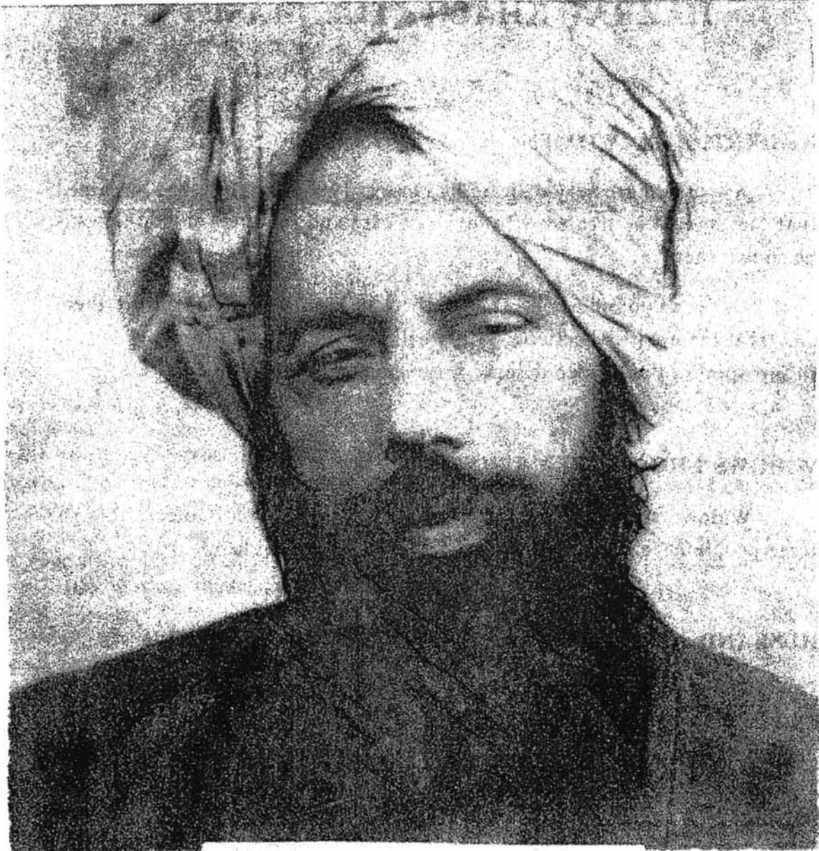
HAZRAT MIRZA GHULAM AHMAD QADIANI The Promised Messiah (May peace be upon him)