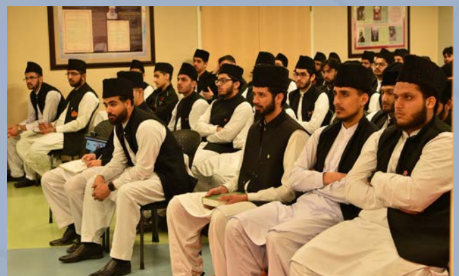
Jamia students attending Jalsa Masih-e-Mau'ud as