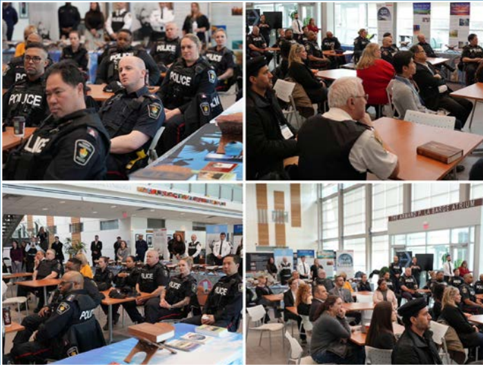
Explore Islam Exhibition at YRP Headquarters, Aurora

On March 30, 2023, Majlis Khuddamul Ahmadiyya of Newmarket and the Northern Ontario region organized the Explore Islam Exhibition at York Regional Police Headquarters, Aurora. The event was attended by more than 70 officers of the York Regional Police (YRP), including their deputies and superintendents.