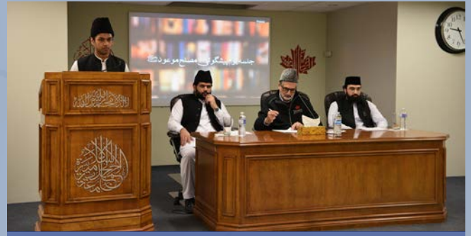
Jalsa Prophecy of Musleh Mau'ud as