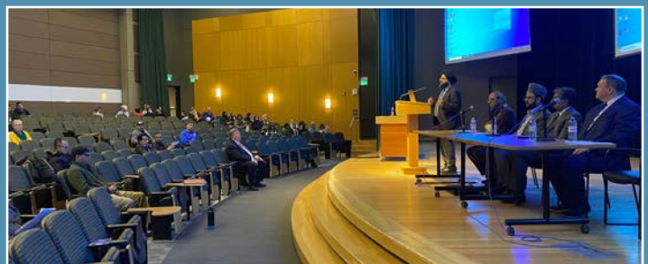
Interfaith Symposium at the University of Regina

On Thursday, March 2, 2023, the Ahmadiyya Muslim Students' Association (AMSA) of Regina held its first interfaith symposium at the University of Regina on "Religion and the Modern World". The event was attended by 90 people, including 45 guests.