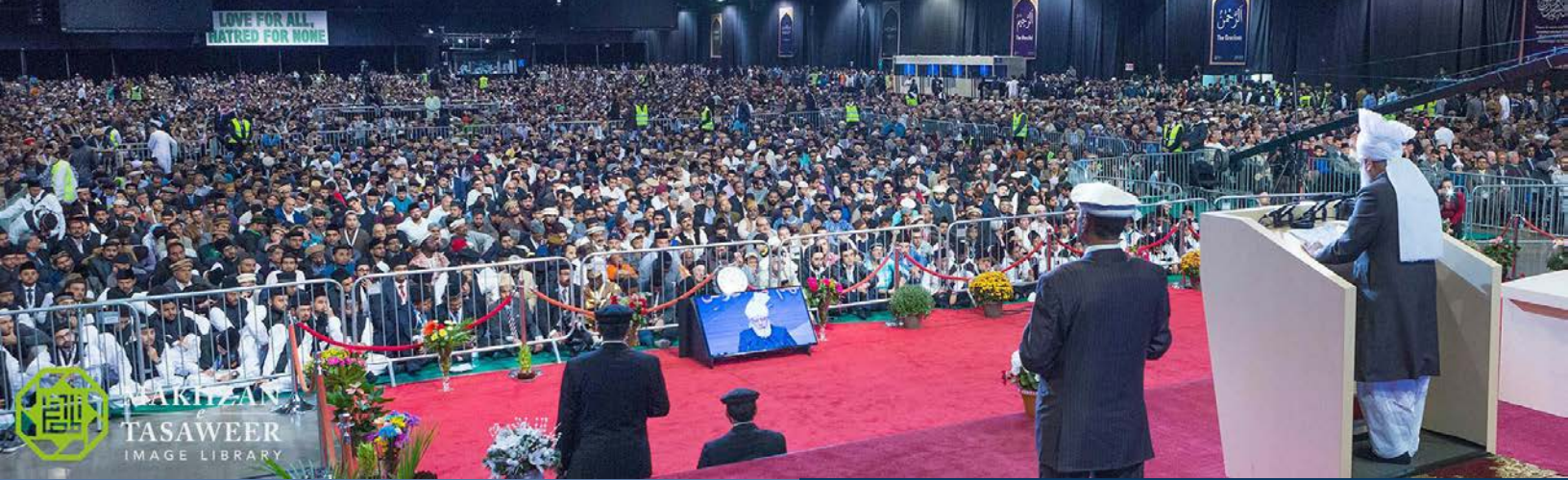
Huzoor aa addressing attendees of Jalsa Salana Canada, 2016