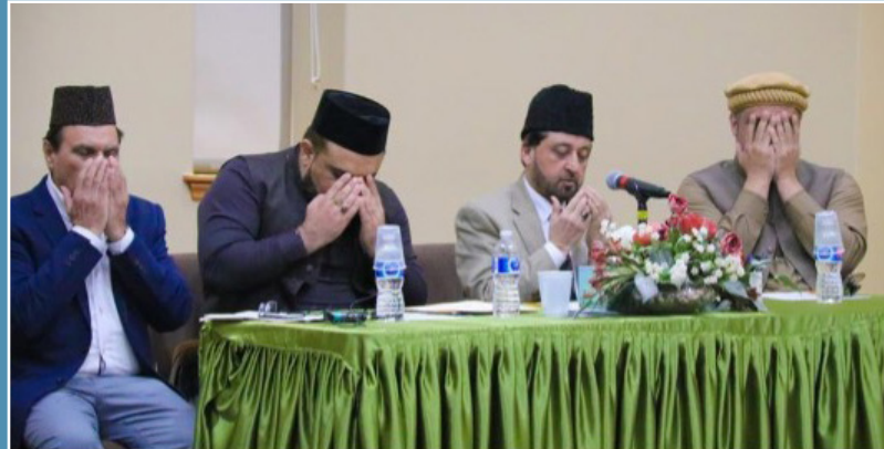
Jalsa Musleh Mau'ud ra at Maryam Mosque, Barrie

This was followed by speeches presented by the local missionary,