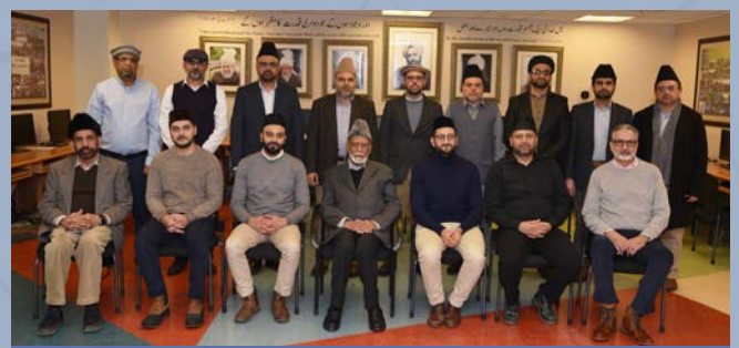
The Review of Religions delegation & the Jamia faculty