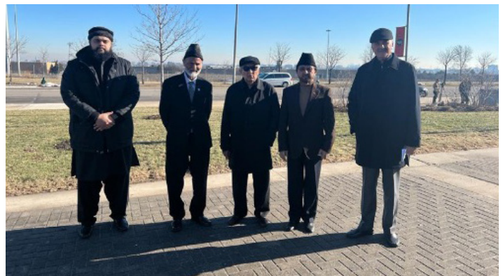
Members of the Jama'at delegation to Hazel McCallion's funeral