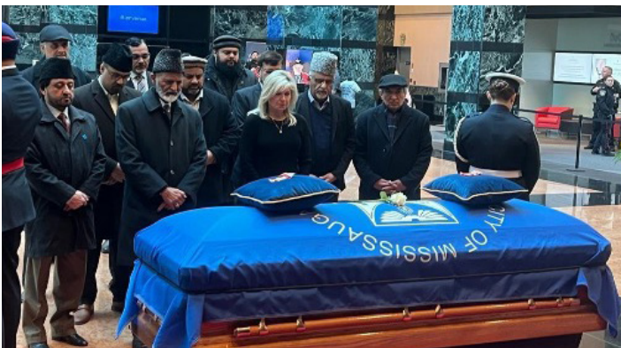
Jama'at delegation paying respects at City Hall, Mississauga