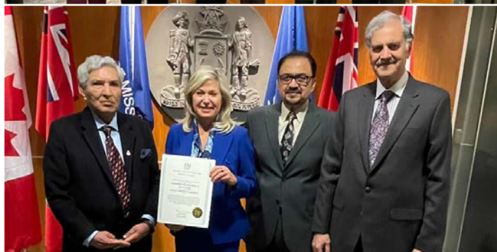
Members of the Mississauga Jama'at's PR Team with the Mayor of Mississauga