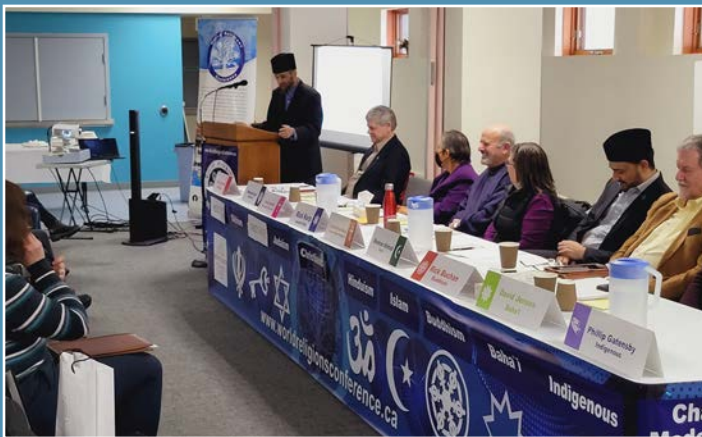
World Religions Conference, Yukon

By the grace of Allah, the Jama'at held three events in two days: a meeting with indigenous peoples, an Explore Islam Event at a library, and the world religions conference.