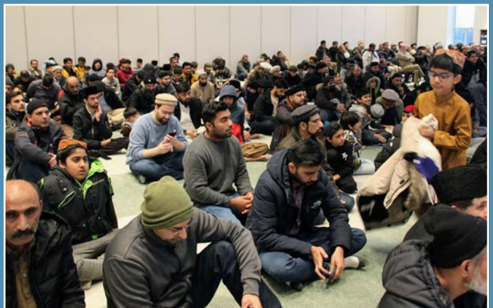
Jalsa Promised Messiah as Day, Brampton

Overall, the Jalsa Masih-e-Mau'ud as Day held by Brampton West Jama'at was a very successful event, which provided a means for members to gain knowledge and insights on the life and teachings of the Promised Messiah as . The event was well-attended, and participants expressed their appreciation for the informative and engaging speeches and presentations.