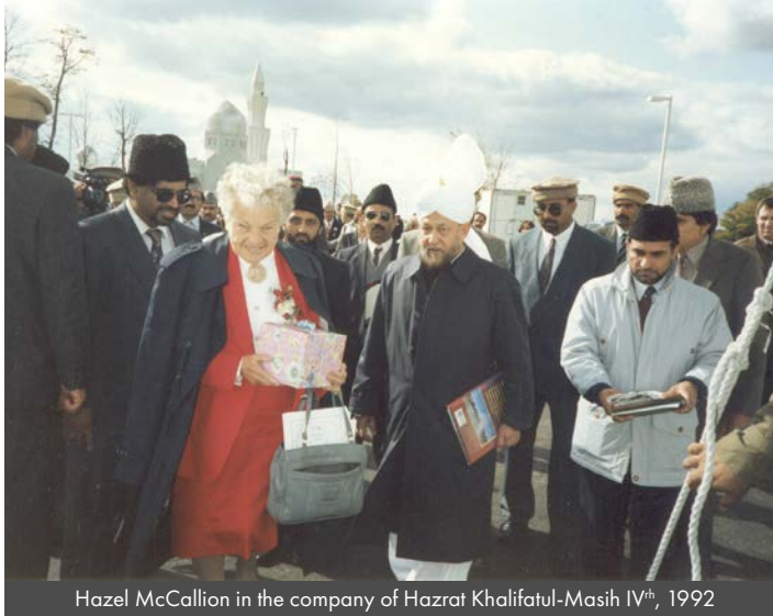
Hazel McCallion in the company of Hazrat Khalifatul-Masih IV th , 1992

Apart from her mayoral activities, Hazel McCallion had a deep love for hockey and played professionally in the 1930s. She played centre position for a sports team sponsored by Kik, a cola brand, and made $5 a game—the equivalent of which is about $65 (US) today. In the year 1987, the Women’s World Hockey Championship named its trophy the Hazel McCallion World Cup in her honour. Even in her 80s, Hazel always carried a hockey stick in the trunk of her car, in case she came across a game. Besides Hockey, Hazel McCallion also enjoyed fishing, hiking, and biking—she even biked five miles to work at one point to promote sustainable and eco-friendly alternatives to driving. Furthermore, Hazel provided leadership as a district commissioner with the Girl Guides of Canada in the 1960s; this organisation encouraged young girls and women to volunteer and enjoy camping, travel, educational activities & community service.