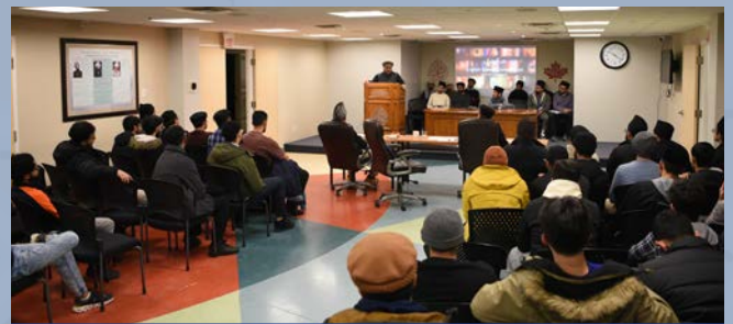
English speech competition